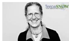
Teepa and Team

Thank you so much for your desire to learn and your commitment to making a positive difference!