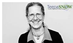
Teepa and Team

Thank you so much for your desire to learn and your commitment to making a positive difference!