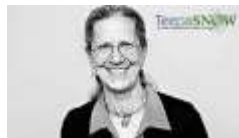
Teepa and Team

Thank you so much for your desire to learn and your commitment to making a positive difference!