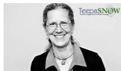
Teepa and Team

Thank you so much for your desire to learn and your commitment to making a positive difference!