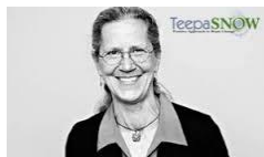
Teepa and Team

Thank you so much for your desire to learn and your commitment to making a positive difference!